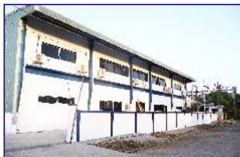
Outside view of Moldex Composites

We wish them all the very best for all their future endeavors.