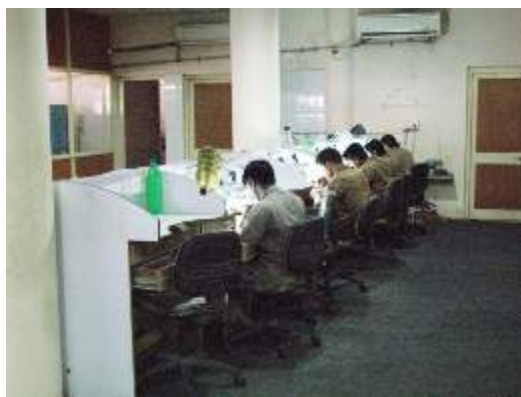
Inside view of the Bahubali Unit Exports Unit

The Company exports most of its manufactured diamond jewelry to the US & the UK.