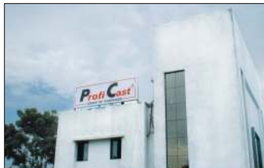
A view of Technomach Factory

The SURSEZ unit has ambitious plans and intends to export its products to the USA, the Middle East, and South East Asian & European markets.