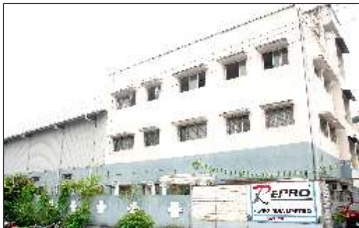
A view of Repro India Limited

Repro has recently commissioned its SURSEZ Unit. The unit stands on a plot measuring 5000 sq. meters with a constructed area of 48,000 sq.feet and another 10,000 sq.feet is under construction. The unit has strategic